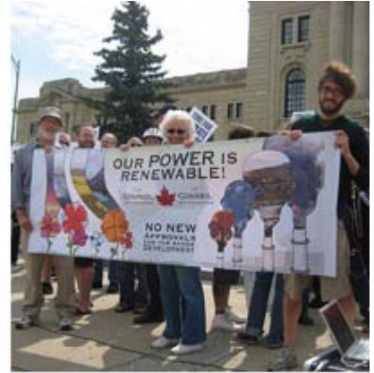
Members of the Council's Regina chapter joined the Climate Showdown in Regina.

For years, Canadians have been told that freer trade, fewer regulations and bigger global markets will bring prosperity to everyone. But after more than 20 years of export-oriented trade, we know that's not true. While big corporations and private investors have profited,